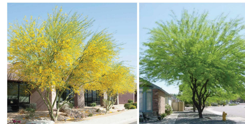
Cercidium 'Desert Museum' Desert Museum Palo Verde