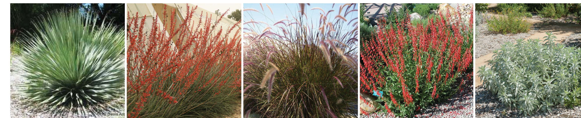
Dasylirion wheeleri Desert Spoon Hesperaloe parviflora Red Yucca Pennisetum setaceum 'Rubrum' Purple Fountain Grass Penstemon eatonii Firecracker Salvia apiana White Sage