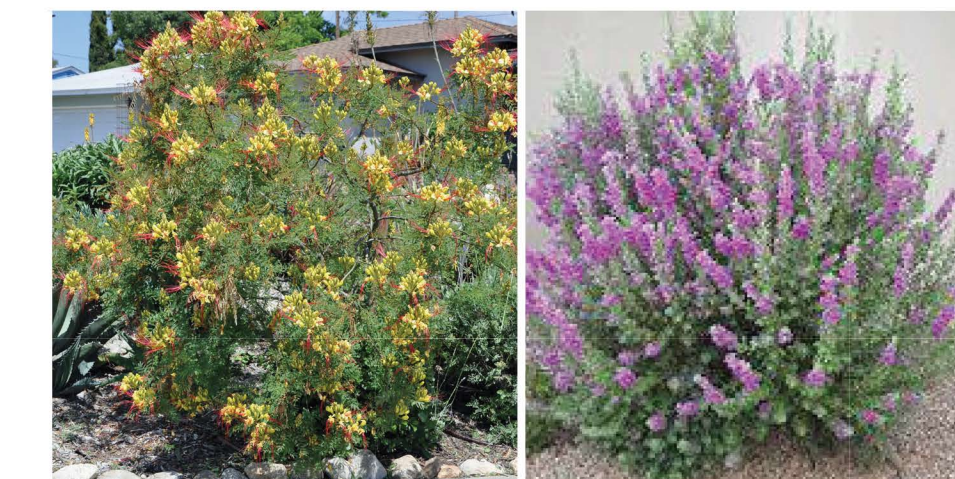
Caesalpinia gillesii Mexican Bird Of Paradise Leucophyllum frutescens 'Compacta' Compact Texas Ranger