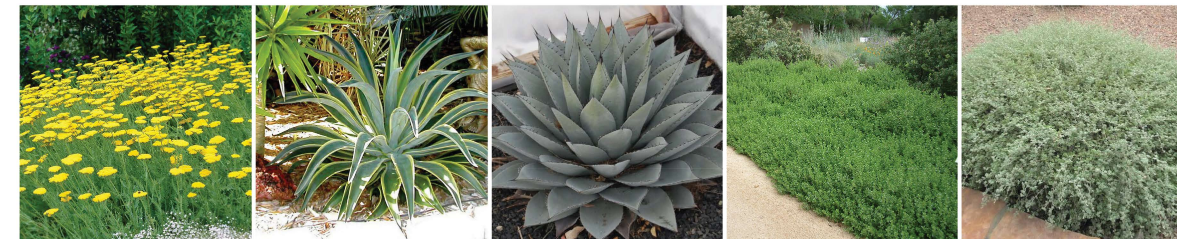
Achillea 'Moonshine' Yellow Yarrow Agave desmettiana 'Variegata' Variegated Smooth Agave Agave parryi Parry's Agave Baccharis pilularis 'Pigeon Point' Dwarf Coyote Brush Dalea greggii Trailing Indigo Bush