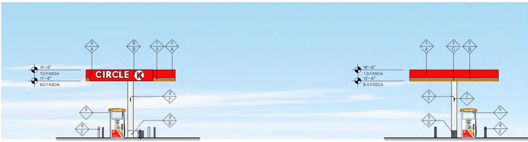
3 'SIDE' ELEVATION (EAST) SCALE: 1/8" = 1'-0"