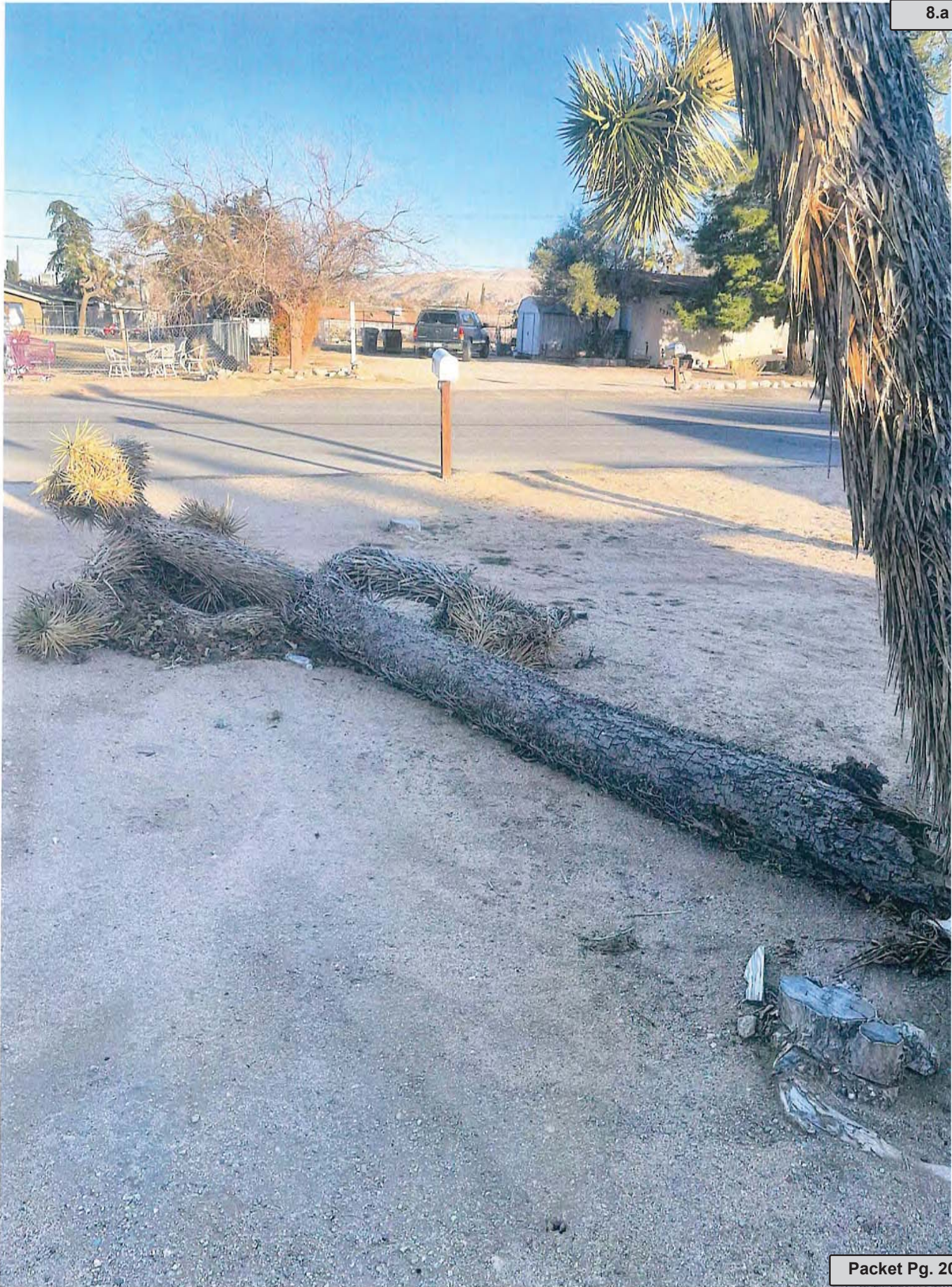
Attachment: WJT 053-22 7520 Elata Avenue (4289 : Western Joshua Tree (WJT) Permit 053-22, 7520 Elata Avenue)