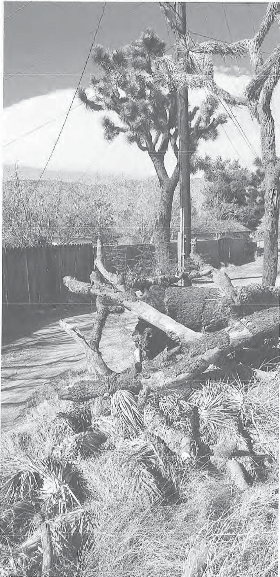
Attachment: WJT 102-21 7204 Palm Ave (4083 : Western Joshua Tree (WJT) Permit 102-21 7204 Palm Avenue)