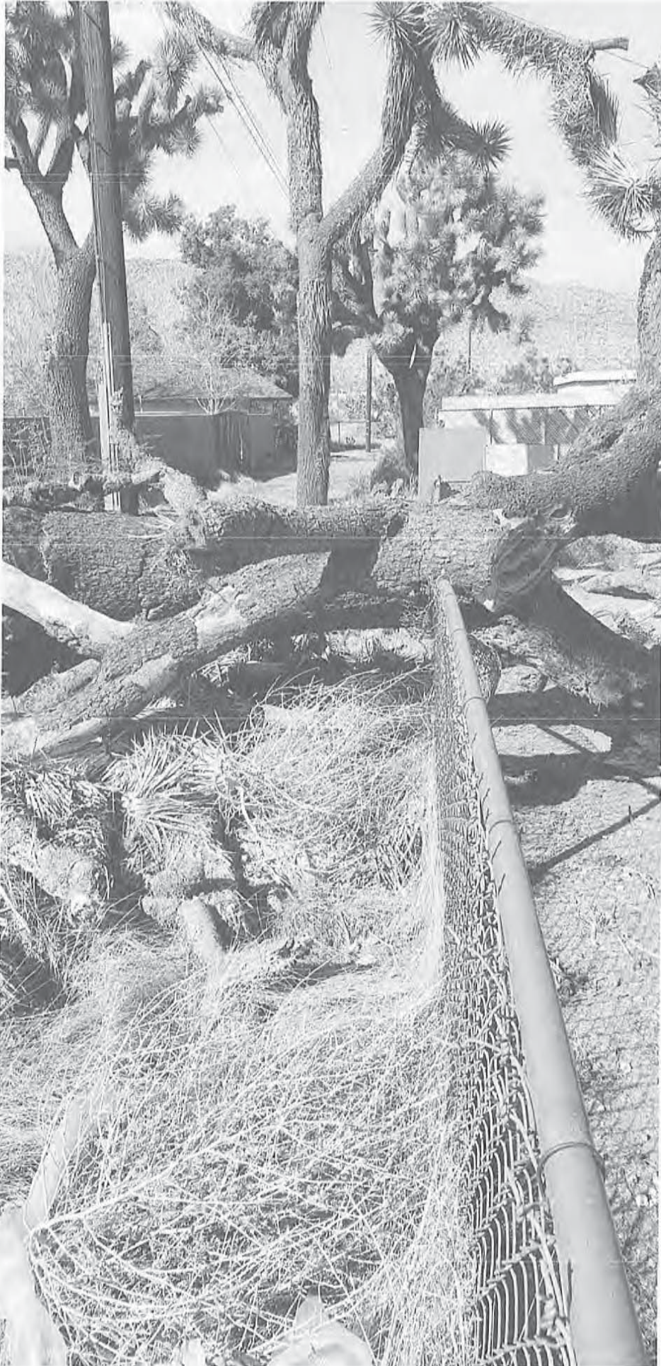
Attachment: WJT 102-21 7204 Palm Ave (4083 : Western Joshua Tree (WJT) Permit 102-21 7204 Palm Avenue)