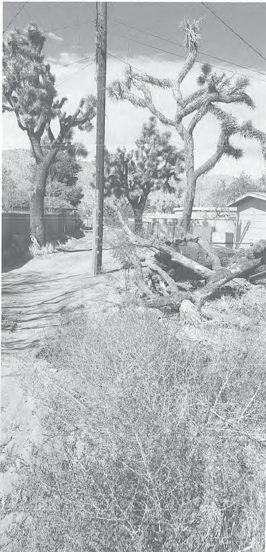
Attachment: WJT 102-21 7204 Palm Ave (4083 : Western Joshua Tree (WJT) Permit 102-21 7204 Palm Avenue)