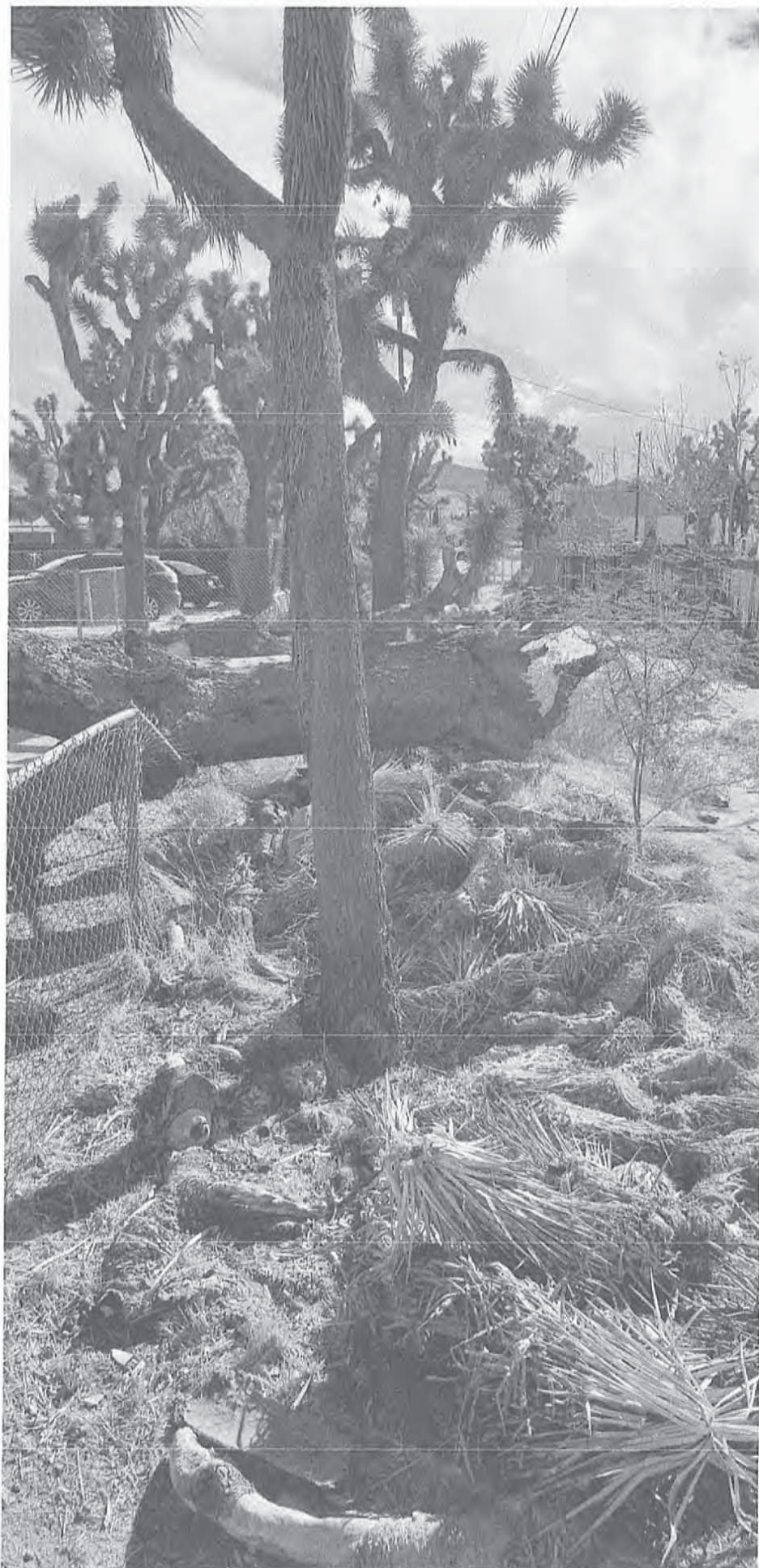
Attachment: WJT 102-21 7204 Palm Ave (4083 : Western Joshua Tree (WJT) Permit 102-21 7204 Palm Avenue)