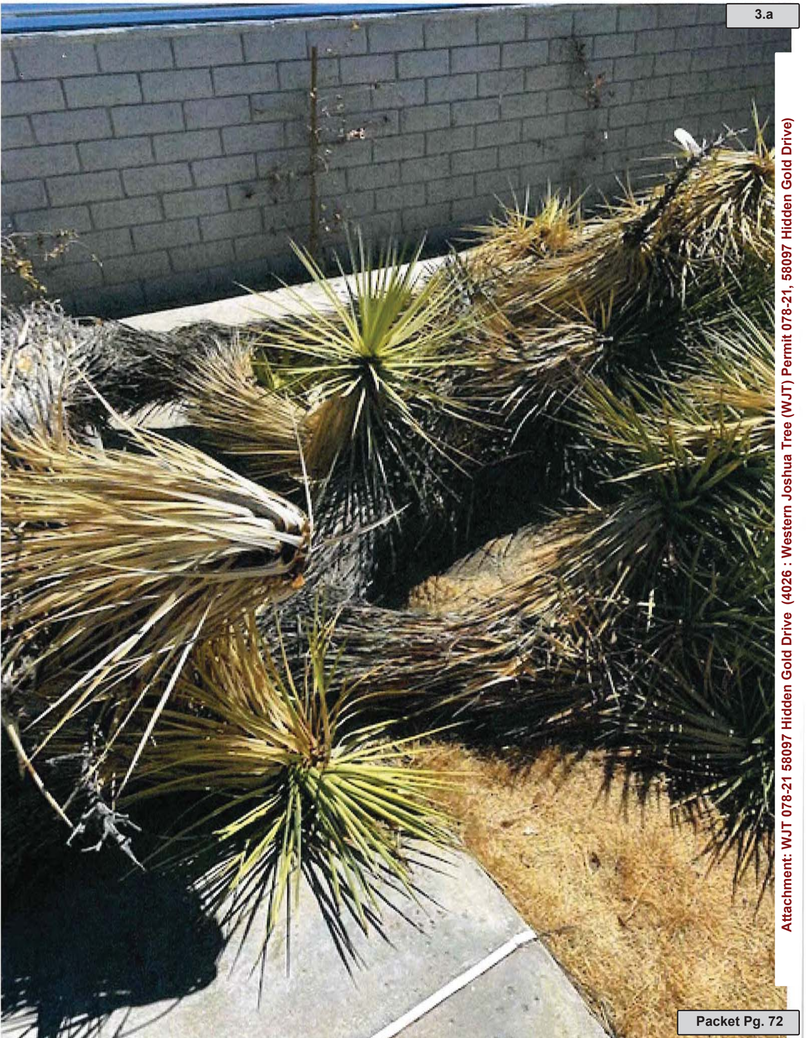
Attachment: WJT 078-21 58097 Hidden Gold Drive (4026 : Western Joshua Tree (WJT) Permit 078-21, 58097 Hidden Gold Drive)