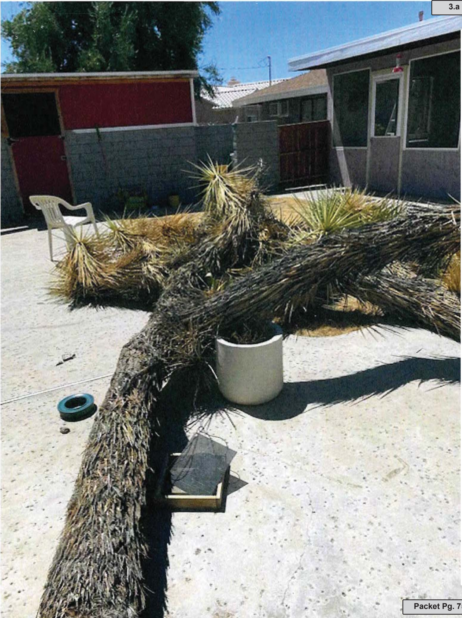
Attachment: WJT 078-21 58097 Hidden Gold Drive (4026 : Western Joshua Tree (WJT) Permit 078-21, 58097 Hidden Gold Drive)