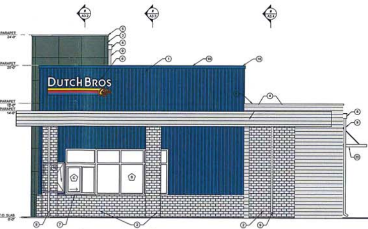
4 SIDE ELEVATION A1.1 XL 2040