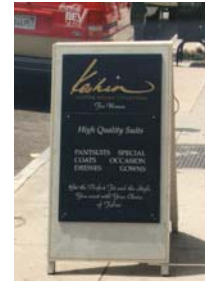
Examples of freestanding signs