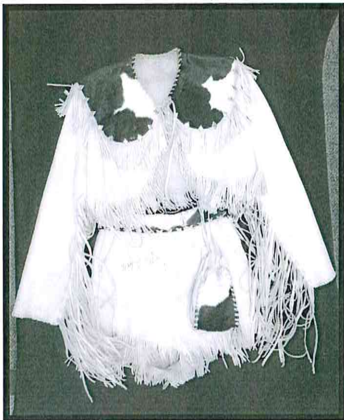
Possible Accession: HDNM Temporary Custody #106